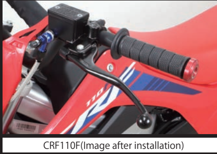
CRF110F(Image after installation)